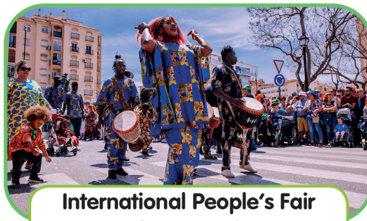
International People's Fair of Fuengirola