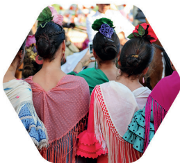
Fair of Seville

February • April • May • August • October