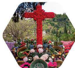
Festival of the Crosses