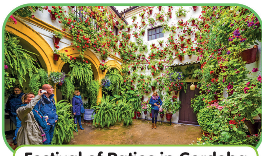
Festival of Patios in Cordoba