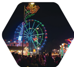
San Lucas Festival of Jaen