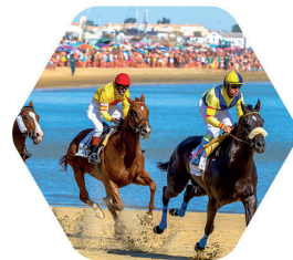
Horse racing festival of Sanlucar