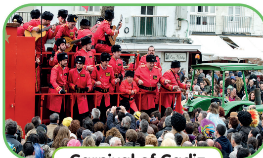
Carnival of Cadiz

8 Talk with a partner. What makes a festival special? What words can you use to talk about festivals? Use the photos in exercise 5 to help you.